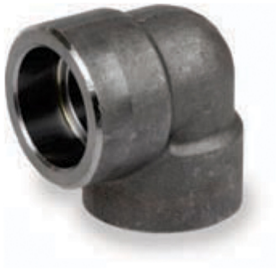
Fig. 52E 3 – 90° Elbow